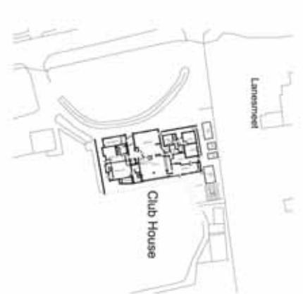
2 Site Location Plan Scale: 1:100 @ A4